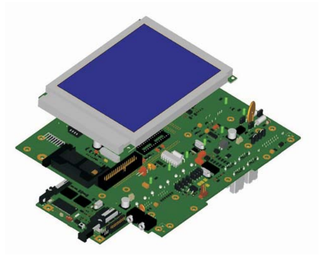
Figure 2- OEM with "Application" board and "System

The OEM can engineer an effective solution with a “Application Board” which typically contains plugs, connectors, sensors, backlight inverter for the LCD/Flatpanel, batteries, special bus interfaces and peripherals. In short