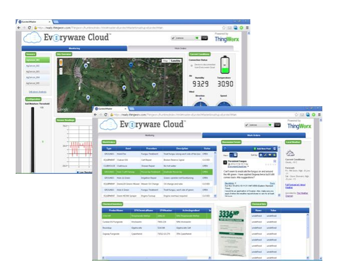
ThingWorx-based Visualization and Mash-up