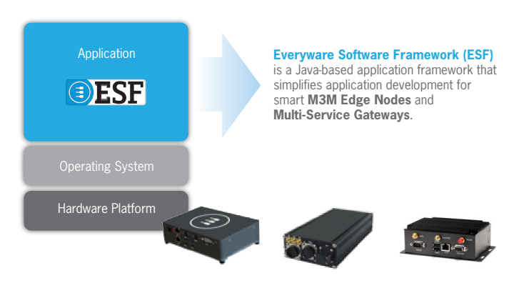
Fig.1 ESF as Abstraction Layer

Another benefit of the Eurotech Everyware Cloud is it can capture and act on vending machines status errors