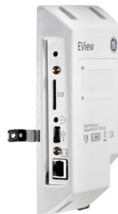
EView device accessory from GE Healthcare

GE Healthcare's data capture device accessory was based on the Eurotech TurboXb computer on module, and as follows typical Eurotech engagements, Eurotech was also responsible for the board support package for the Windows embedded operating system.