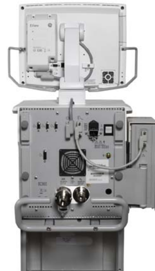
EView installed on back of Engstrom (top left)

The EView attaches directly to the back of the Engström, capturing the output data of the ventilator. Captured, this data is then available to the clinician for downloading and viewing at any given time. The mobility of EView also allows the device accessory to move from one Engström to another.