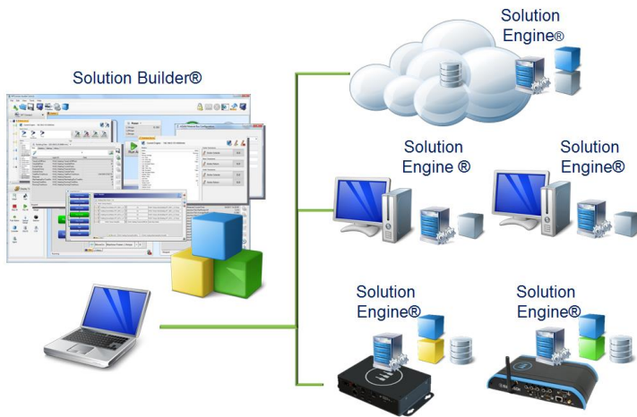
Solution Family's Builder® and Engine®