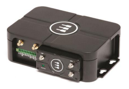
Figure 2 – Eurotech IoT Gateway with ReliaCELL module

The initial application developer had moved on, so FreeWire needed someone to finish transferring their basic code to the Eurotech platform. They found that Eurotech provided professional services as well, so they engaged with Eurotech to get their software deployed on the Eurotech hardware and IoT platform. FreeWire had made strong progress, and Eurotech filled in the gap to finish the development in approximately one week.