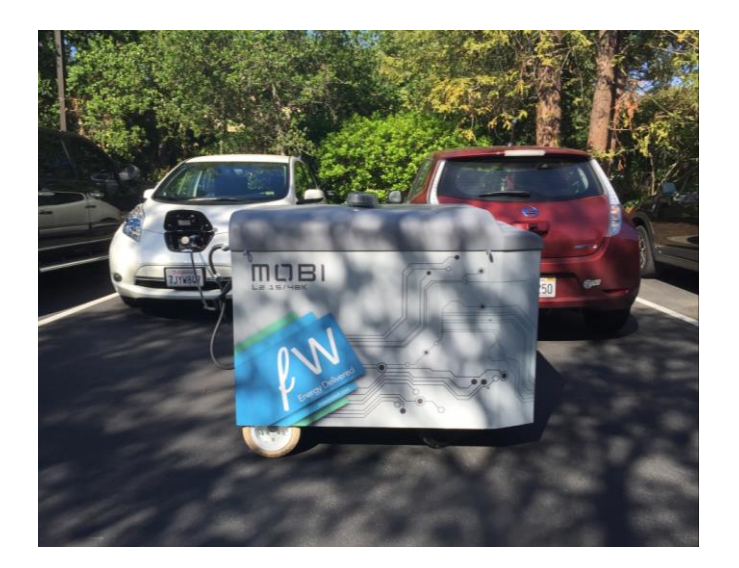
Figure 1 – Mobi Charger

Although electric vehicles (EVs) are gaining in popularity, one of the roadblocks for widespread adoption is charging capabilities. Drivers are hesitant to purchase electric vehicles due to a perceived scarcity of charging stations, and energy costs, while lower than gasoline, are still high. To address this need, FreeWire developed the Mobi Charger, a mobile EV charging station that can move from car to car to allow for easy charging at a workplace, mall or public parking structure.