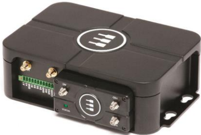
Figure 2 – Eurotech IoT Gateway with ReliaCELL module

The initial application developer had moved on, so FreeWire needed someone to finish transferring their basic code to the Eurotech platform. They found that Eurotech provided professional services as well, so they engaged with Eurotech to get their software deployed on the Eurotech hardware and IoT platform. FreeWire had made strong progress, and Eurotech filled in the gap to finish the development in approximately one week.