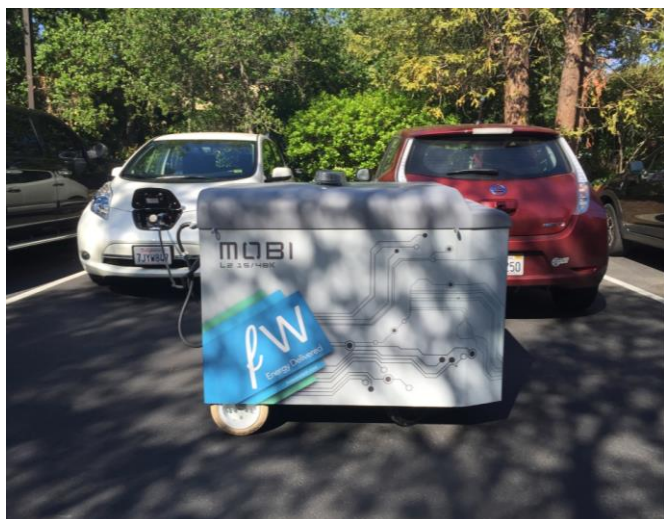
Figure 1 – Mobi Charger

Although electric vehicles (EVs) are gaining in popularity, one of the roadblocks for widespread adoption is charging capabilities. Drivers are hesitant to purchase electric vehicles due to a perceived scarcity of charging stations, and energy costs, while lower than gasoline, are still high. To address this need, FreeWire developed the Mobi Charger, a mobile EV charging station that can move from car to car to allow for easy charging at a workplace, mall or public parking structure.