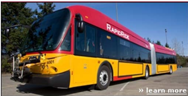
King County RapidRide bus

provide additional vehicle location updates every 30 seconds. Those 60 seconds can make a big difference if someone is late to a bus stop and trying to figure out if the bus has already arrived and left again.