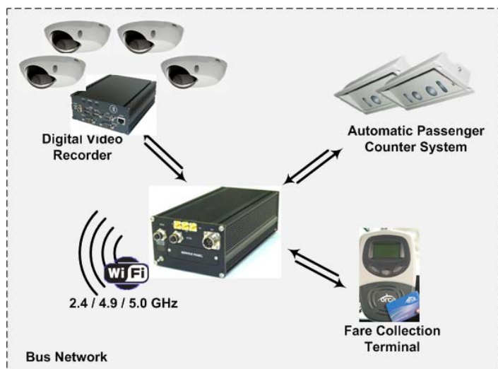
Complex System Architecture

Metro needed a state-of-the-art router to accomplish all of these additional tasks with a new IP network-based ITS infrastructure.