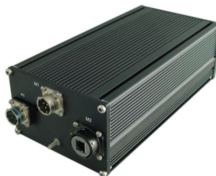
Eurotech's DuraMAR 2150 Mobile Access Router

DuraMAR was compatibility with King County’s existing network.” Eurotech’s DuraMAR is a modular mobile access router and will be used to seamlessly connect vehicles to the agency’s IP network through the 4.9 GHz wireless corridor along the route, as well as 4.9 GHz hot spots at the bus garages.