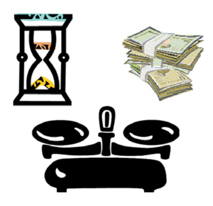
Figure 7- "Time is Money" is not just a proverb; it is the very core of the notion of investment. For good investments, Time is worth a great deal of Money.

The pennies of the DIME are spent over a period of years. Future revenue or savings must be discounted compared to initial costs or immediate cash inflow. Product development is not like development of a bond portfolio; the bank is not going to loan much money to a firm that needs to develop a product, and even if the firm can get a bank rate loan, that loan will be only for a portion of the cash on hand diverted to the development effort.