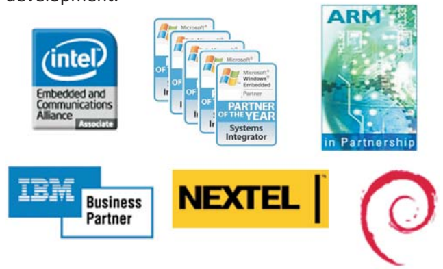
Figure 3- Eurotech has multiple Vendor certifications and awards.

In an environment where technology upgrades every two years or so, deep, multi-level supplier relationships are required. By focusing on ARM, CE and Linux, Eurotech has developed close relations with the principle suppliers. Eurotech is active in the beta programs from Intel and Microsoft, and we contribute to the Debian community as well. Our connections go deeper than the sales and support organizations; we routinely call into, and get support from, our suppliers' product management, development and even research teams. Indeed, the path runs both ways, where sometimes our senior personal are asked to participate in pre-alpha reviews and actually direct our supplier's development.