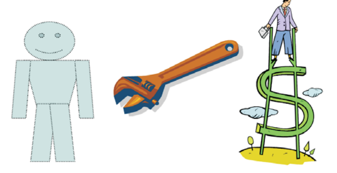
Figure 2- Good people, quality tools and first tier vendor support are required for an Architected Design.

The designer of the system is its' architect and as such sets the pattern for the full product lifecycle. A typical design package, sometimes referred to as "Schematic, Bill of Material, Gerber's and BSP" is typically sold in competitive bid, for somewhere between $250K and $750K depending on scope and how new the design is in comparison to the CPU release date. More than a dozen companies contend for this business, so the observed market pricing should be considered a reasonable indication of underlying costs. Costs can be manipulated a bit by the use of plug in modules but this typically only moves the cost from one portion of the device at one time in its lifecycle, to another portion of the device an another time. Good, architected design costs money.