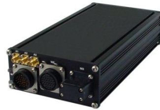
FIGURE 3. DURACOR 1200, BASED ON EUROTECH REFERENCE BOARD, ISIS PC/104 EMBEDDED COMPUTER

immediately to start testing PTC prototype applications. The primary function of a DuraCOR is to provide a platform to run a PTC service. The DuraCOR 1200 is made to comply with the international standards to withstand shocks, vibrations and high humidity, maintaining high reliability and precision. It can withstand extended temperature ranges without using active cooling fans.