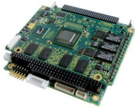
FIGURE 2. EUROTECH REFERENCE BOARD, ISIS PC/104 EMBEDDED COMPUTER WITH INTEL ATOM PROCESSOR

All PTC wayside messaging servers must use one of two reference embedded boards and Red Hat Linux. Eurotech's ISIS PC/104+ single board computer was selected as one of the two reference boards for proper PTC operation.