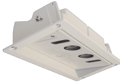
Figure 1. The Eurotech DynaPCN

They are designed for passenger counting above the doorways of buses and rolling stocks, as well as to count people as they enter or leave buildings or any area with restricted access.