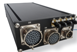
DynaCOR CONNECTED RUGGED MOBILE COMPUTER

Eurotech rugged platforms are the ideal solution for the “connected train”: on board computers, network appliances, intelligent panel PCs for Human Machine Interface , Mobile Access Routers for train to ground communication and for wireless services to passengers.