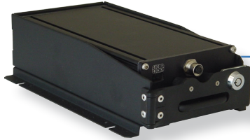
DuraNAS RUGGED NETWORK ATTACHED STORAGE

Eurotech offers a complete solution for video recording and subsequent data analysis specifically designed for the rolling stock market.