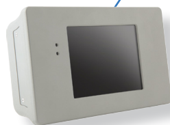
DynaVIS ON BOARD RUGGED CONSOLE

The Everyware Cloud from Eurotech is a Machine-to-Machine Integration Platform that simplifies device and data management by connecting distributed devices over secure and reliable cloud services. Once devices are deployed, the Everyware Cloud allows users to connect, configure and manage devices through the lifecycle, from deployment through maintenance to retirement.